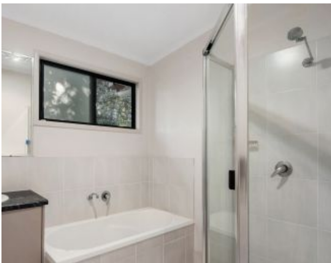
4A Sunland Court, BEERWAH